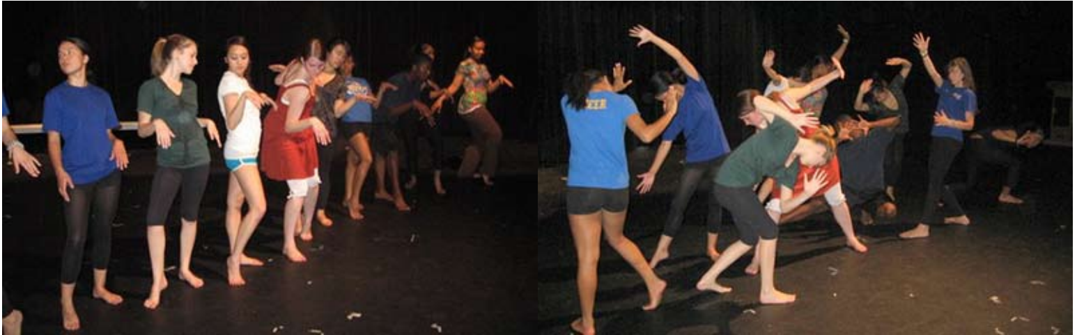
The Danger Zone Dance Company rehearses a "cool" section of their dance.

The concert will be held on Thursday, Friday, and Saturday evenings, April 30, May 1 and 2, at 7:00 in the Robert Frost Auditorium, 4401 Elenda Street, Culver City High School. Admission is $10 general and $7 ASB, faculty, seniors, and children under 12. Tickets are available at the door 30 minutes before the performance. AVPA Season Pass holders are permitted free of charge.